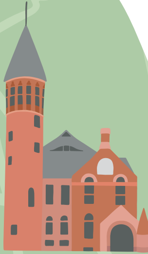
NORWICH FREE ACADEMY