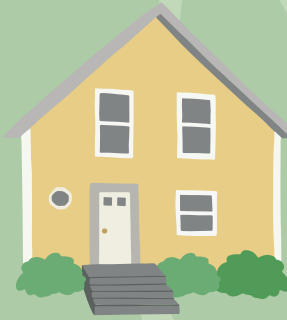
59 SCHOOL ST