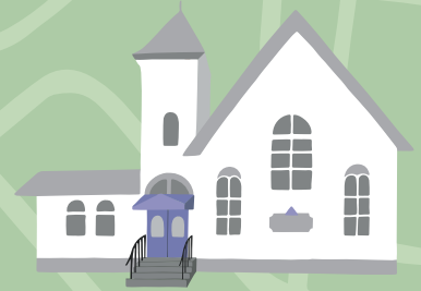
EVANS AME ZION CHURCH